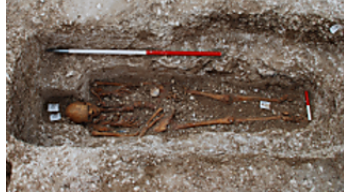
GenomeWeb Medieval Pilgrim Excavated in UK Carried Leprosy Strain That Still