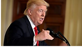
France 24 Trump attacks media again in early morning Twitter blast