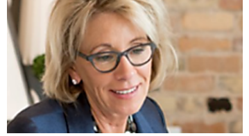
InsideSources DeVos Agrees to Release Tax Returns, Forego Certificate of