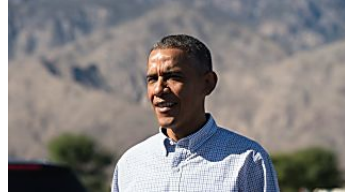
Mansion Global Talk Resurfaces that Obama is Buying Rancho Mirage Home